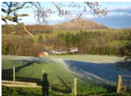
View of Cosses Country House and Knockdolian